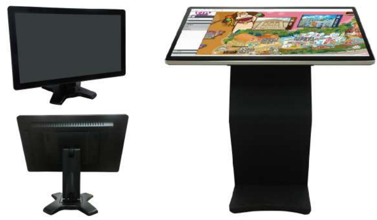
This image shows 19" capacitive screen with optional stand installation This image shows 43" capacitive screen with optional bed stand installation

▶ Table/K-type stand installation diagram