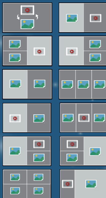
Image section Video section