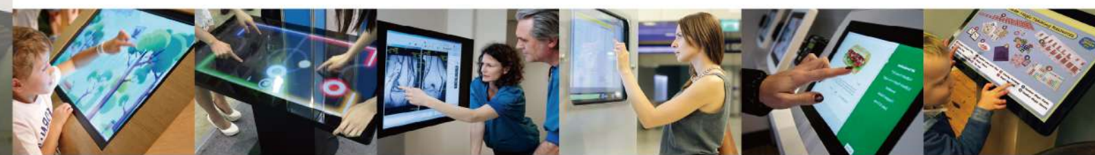
※All of the photos are from Rich Source & Pinterest