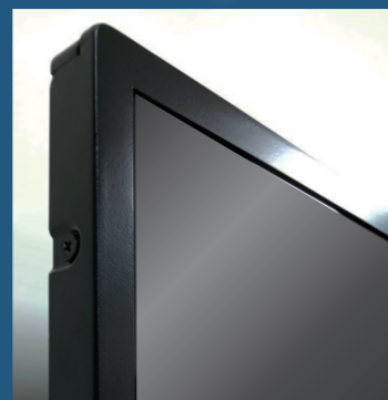
Ultra-slim screen frame design

Insert the USB into the computer, upload your program content, and then simply plug the flash drive into the screen to automatically start a slideshow of images and videos